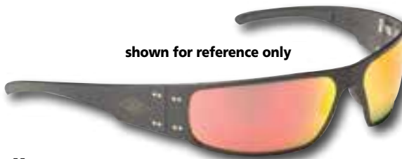
shown for reference only