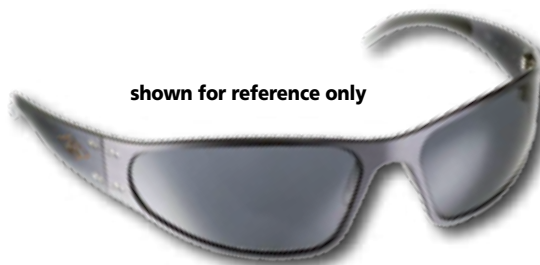
shown for reference only