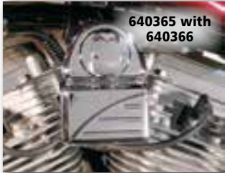
640365 with 640366